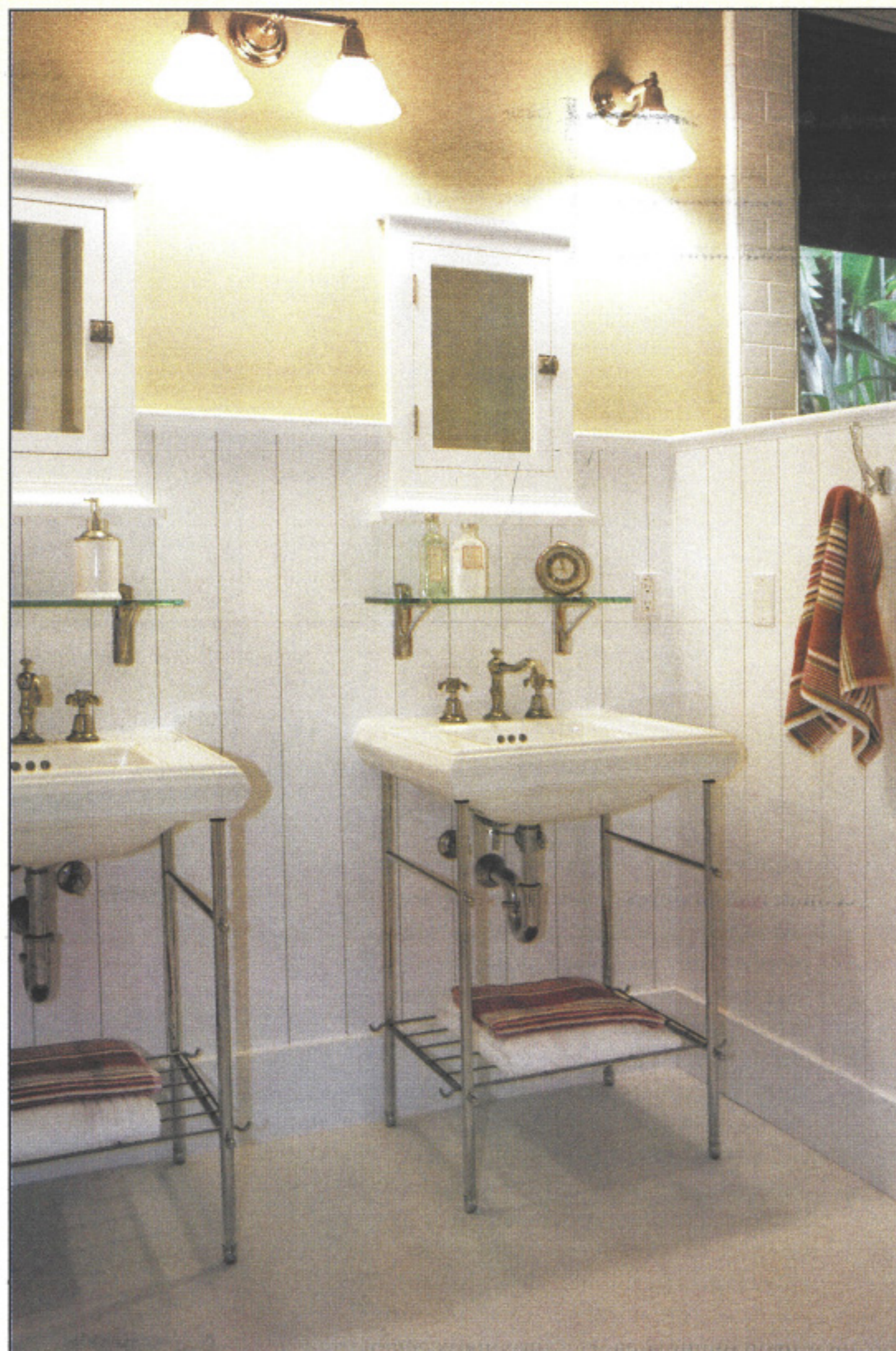
Twin pedestal sinks in the guest bathroom are set against a backdrop of shiplap with wainscot cap. Light fixtures from Restoration Hardware.

The star of the home, the kitchen showcases ►