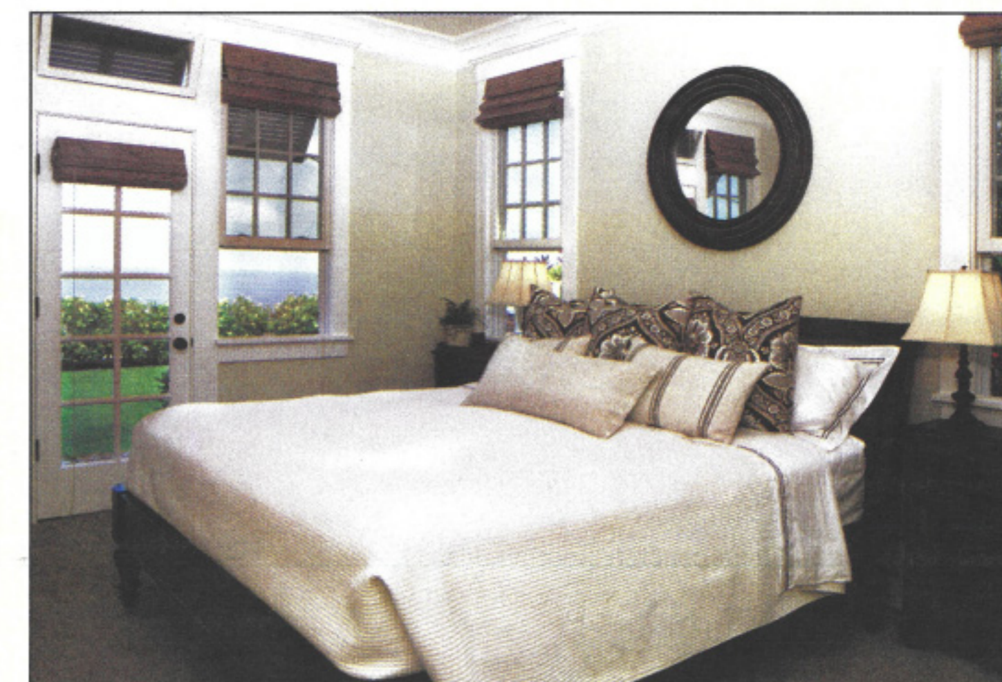
Double-hung windows and French doors offer ocean views from the master bedroom. Seagrass carpet from Bamboo Too is trimmed with bamboo thresholds. A hopper window above the door keeps the air flowing.

Says Greg: “We really enjoyed the process of starting from scratch and putting this all together the way we wanted. We just loved doing this house.” AH