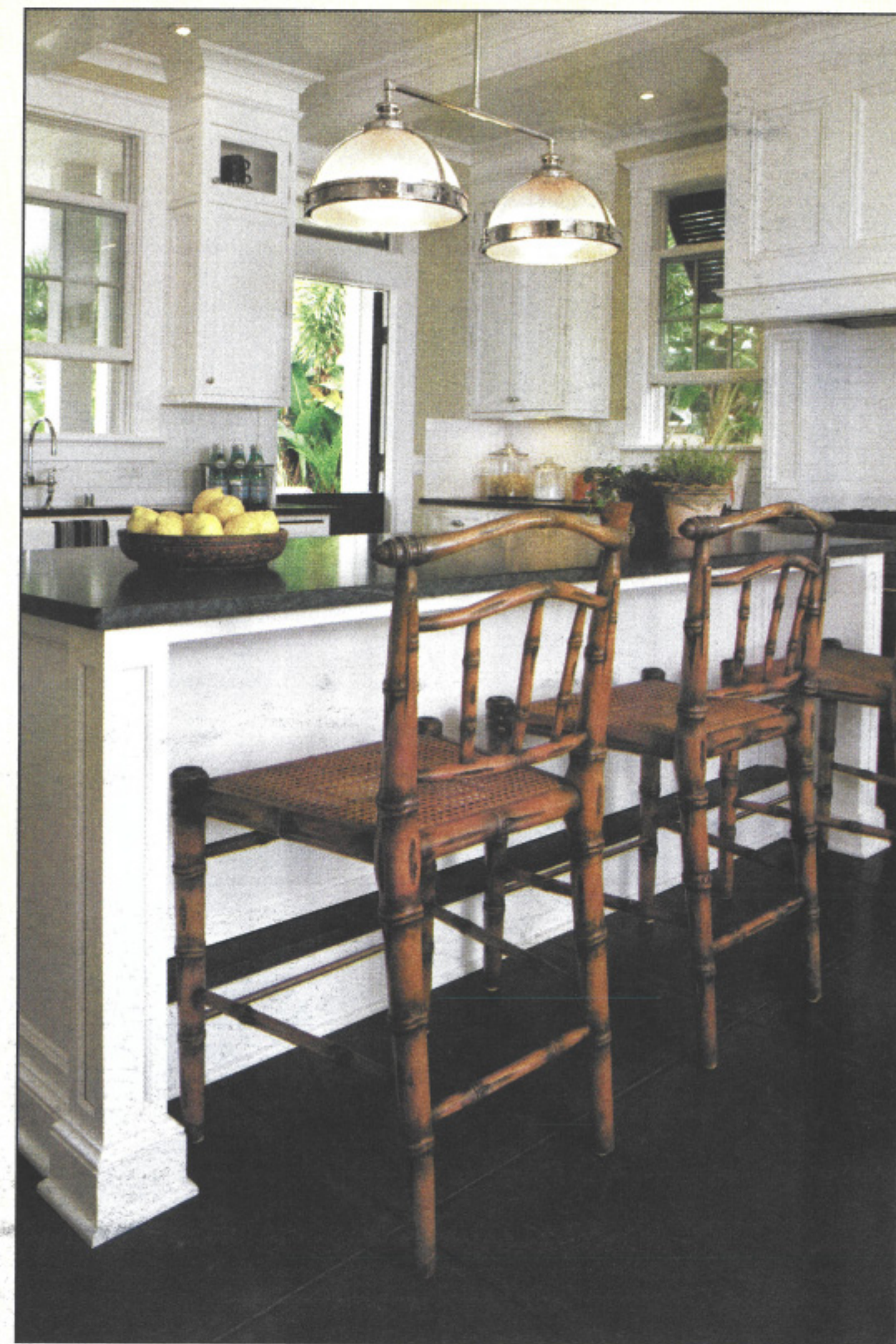
Outfitted with cabinets from Mauna Kea Kitchen & Bath in Kona, the kitchen displays double-hung windows, crown moulding, and shiplap ceiling for a beadboard effect. To match the cabinets, Greg built a stove hood that looks like a mantle.