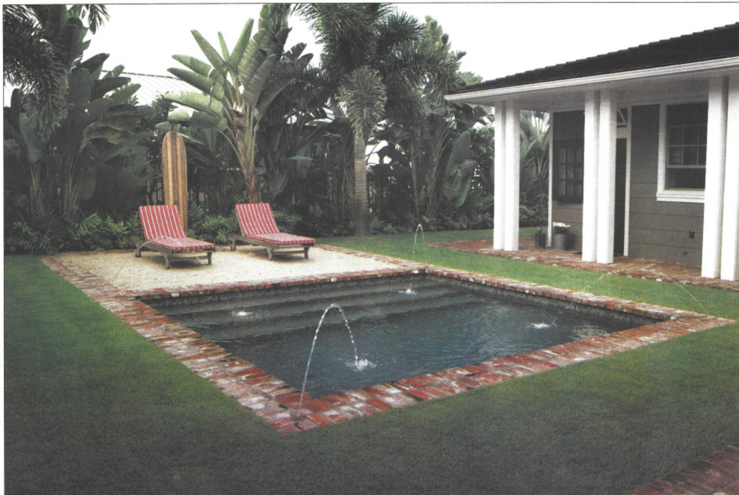
Built around a central courtyard, the U-shaped house surrounds a small dipping pool with sandy beach made of imported sand. The upright longboard doubles as an outdoor shower.