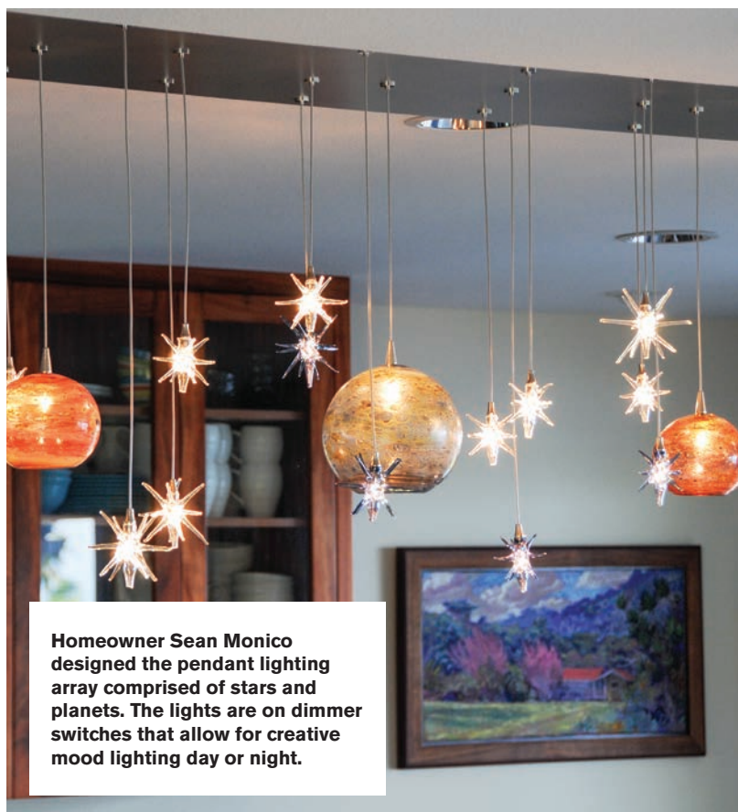
Homeowner Sean Monico designed the pendant lighting array comprised of stars and planets. The lights are on dimmer switches that allow for creative mood lighting day or night.