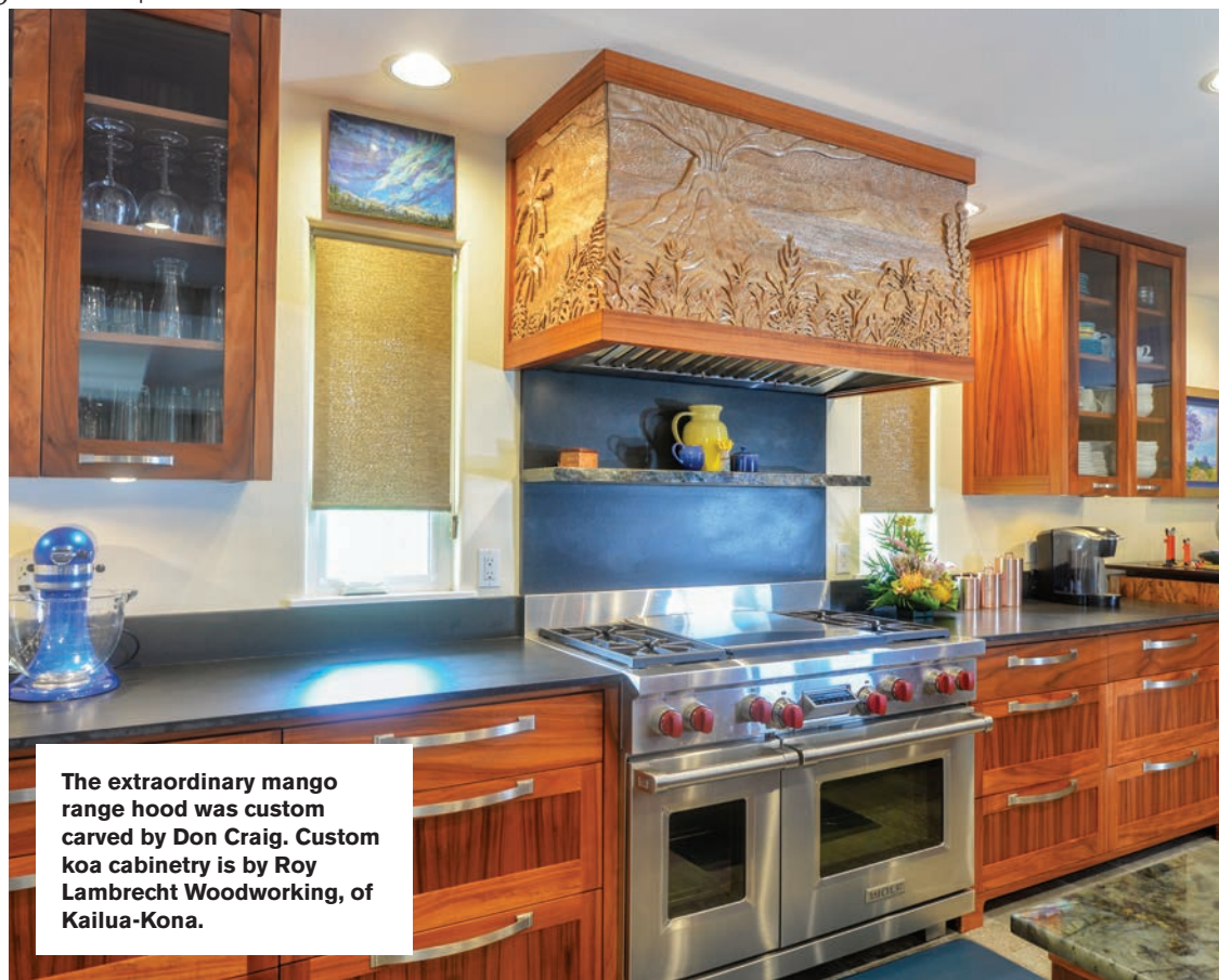
The extraordinary mango range hood was custom carved by Don Craig. Custom koa cabinetry is by Roy Lambrecht Woodworking, of Kailua-Kona.

deep, allowing for plenty of storage. Topped in a blue opalescent, labradorite granite, the large koa island includes a special footrest that spans the width of the counter, an idea that Kevin came up with.