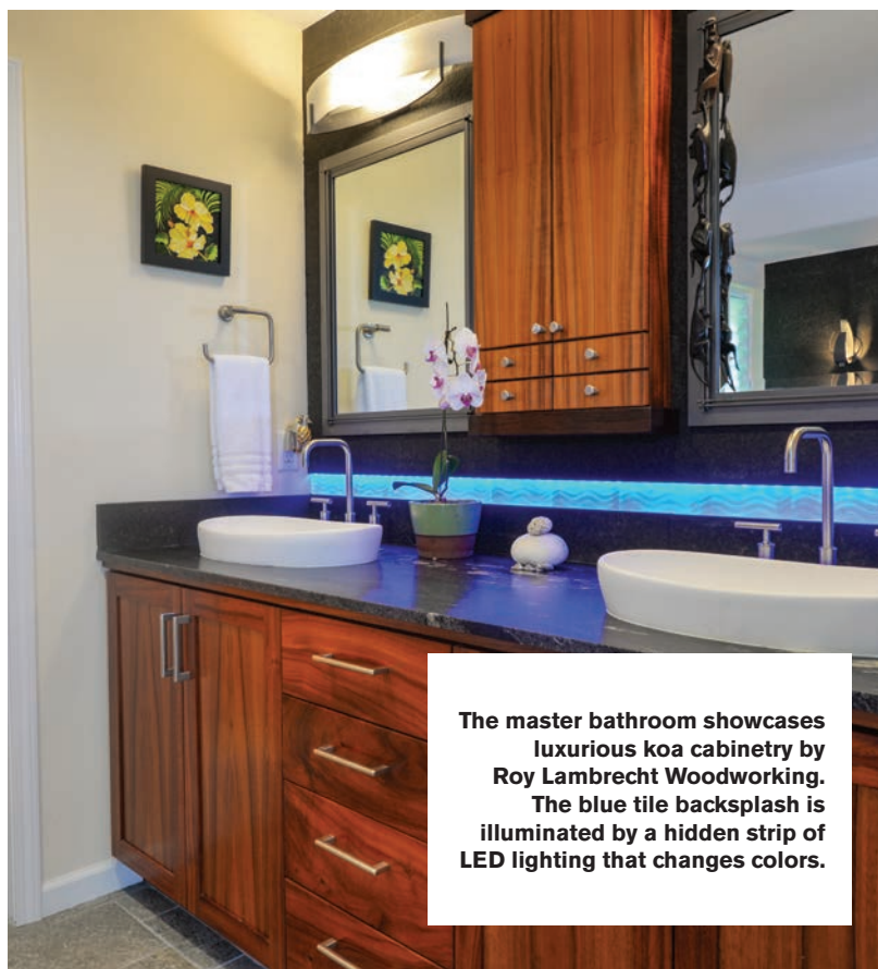
The master bathroom showcases luxurious koa cabinetry by Roy Lambrecht Woodworking. The blue tile backsplash is illuminated by a hidden strip of LED lighting that changes colors.